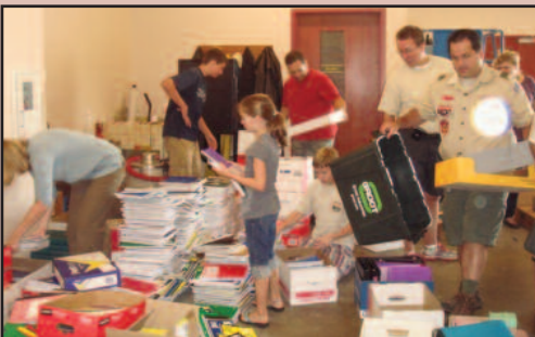
Boy Scout Troop 290 and other volunteers help sort school supplies on August 13

Special thanks go out to Barrington Square Home Improvements B & F Technical Code Services Chicago Slaughter Football CitiBank Curves for Women The Exchange District 54 Program Services, First American Bank, Hamilton Partners Harris Bank Health First Wellness Hoffman Estates Comm Bank, Hoffman Estates Branch Library Kids Plus Pediatric Dentistry Parkway Bank Prairie Stone Sports and Wellness Roosevelt University Rotary Club of Sch-H.E. Schaumburg Twnshp. Dist. Library Sears Holdings Corporation St. Alexius Medical Center Scott R. Triphahn Comm. Center & Ice Arena Township of Schaumburg, The Village of Hoffman Estates Liberty Mutual Roanoke Trade Services, AIOI Nissay Dowa Ins. Co. Gibbs & Soell Groot Industries