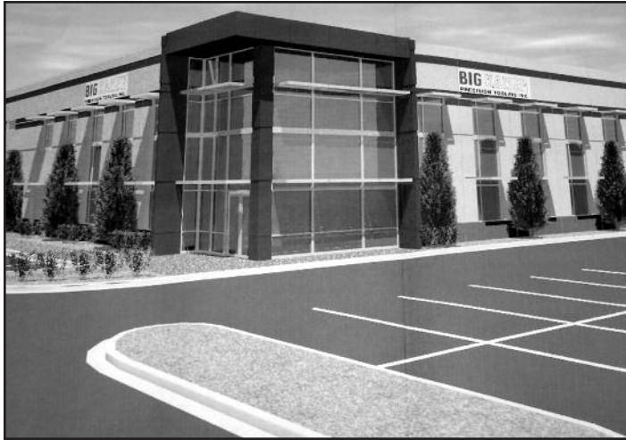
Artists' rendering of the new North American headquarters of BIG Kaiser Precision Tooling, Inc.

The Village of Hoffman Estates is excited to welcome a second build-to-suit tenant at the 70 acre Huntington Woods Corporate Center. Situated just north of the new Mori Seiki U.S.A., Inc., 102,000