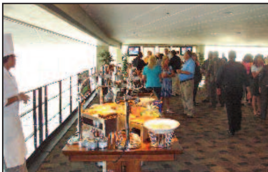
Business After Hours at the Sears Centre on August 18.