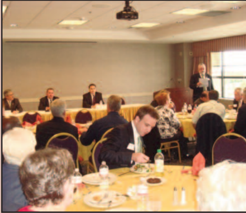
Chamber members heard the latest updates from Springfield at the 2011 Legislative Luncheon

The Government Relations Committee hosted its annual Legislative Luncheon on Friday, Sept 30.