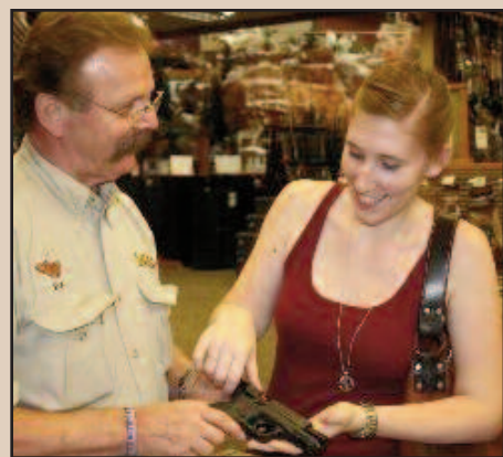
Women of all ages are buying guns and taking aim in growing numbers. Cabela's Ladies' Night Out on October 6 is designed for women who are interested in learning more about the outdoors, from fishing to handguns.

Seminars will include Handguns and Heels, An Introduction to Personal Firearms; Choosing a Handgun to fit your Personality; Dutch Oven Desserts; Campsite Cooking that will WOW Your Family; and Casting for Dinner: An introduction to Fishing Techniques. All classes will be taught by local experts and are free of charge. Additional details and times can be found at www.Cabelas.com/HoffmanEstates.com